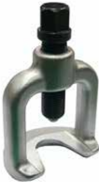
Ball Joint Separator (23mm)