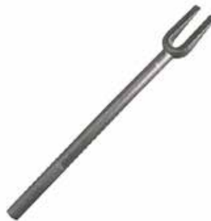
Ball Joint Separator (18mm x 400mmL)

-For splitting track-rod ends and ball joints