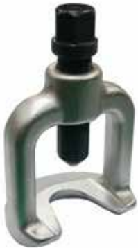
Ball Joint Separator (18mm)