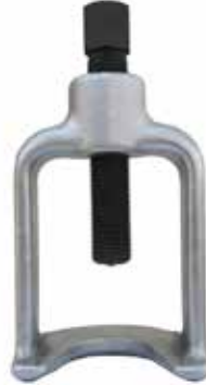
Ball Joint Separator (46mm)

-For splitting track-rod ends and ball joints