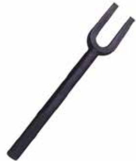
Ball Joint Separator (24mm x 300mmL)

-For splitting track-rod ends and ball joints