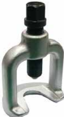
Ball Joint Separator (29mm)