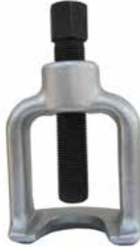
Ball Joint Separator (40mm)

-For splitting track-rod ends and ball joints