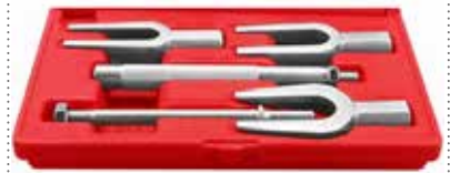
5pcs Tie-Rod / Ball-Joint Splitter Set

-For splitting track-rod ends and ball joints