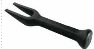
19mm Ball Joint Separator (Casting 19mm)